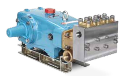
Model 3560 20 gpm (76 lpm), 4000 psi (276 bar)